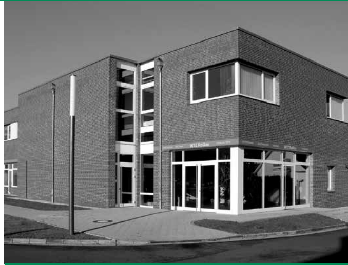
WTZ Roßlau gGmbH