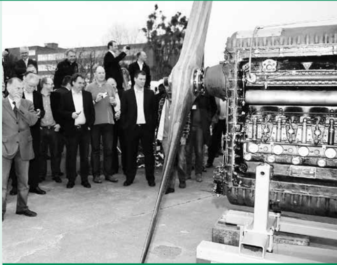
Starting the Junkers aircraft engine Jumo 205C.